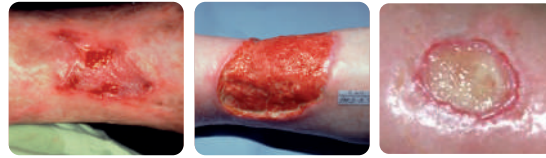
Epithelialising Granulating Superficial Slough